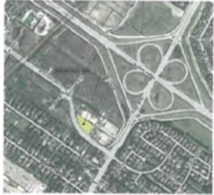
EXISTING PLAN NOT TO SCALE